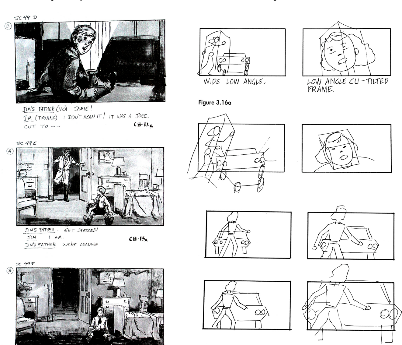
David Jonas' storyboard for Empire of the Sun.

Some example storyboards to use as reference, both detailed and rough: